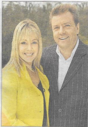
Homes Under the Hammer's presenters Martin Roberts and Lucy Alexander