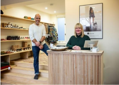
Barkened, Deal High Street

NUE raced into action quickly exhausting the £1m available which has resulted in 12 individual projects being funded in the following districts: Dover, Folkestone & Hythe and Thanet. The final project is due to complete in 2021.