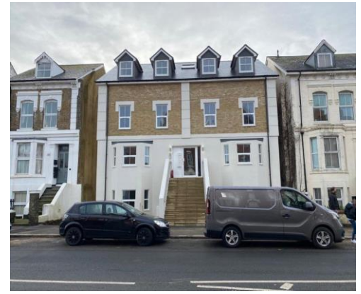
Ottaway House, Dover

The building, which has been called Ottaway House, is named after Dover-born sportsman, Cuthbert Ottaway who captained the England Football team against Scotland in 1872 in what is now recognised as the first international match to be played.