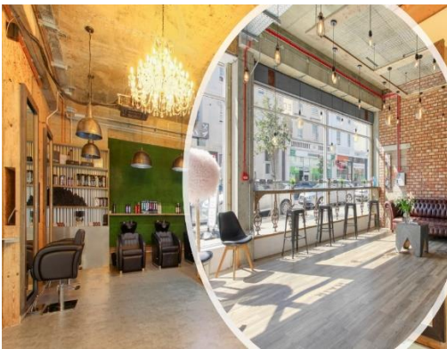
Browns, Sandgate Road, Folkestone

Projects have included: New independent lifestyle store, café, convenience store, office space for a recruitment agency, delicatessen, pizzeria at Breakwater Brewer (from an old warehouse) and a Hair and Beauty Salon.